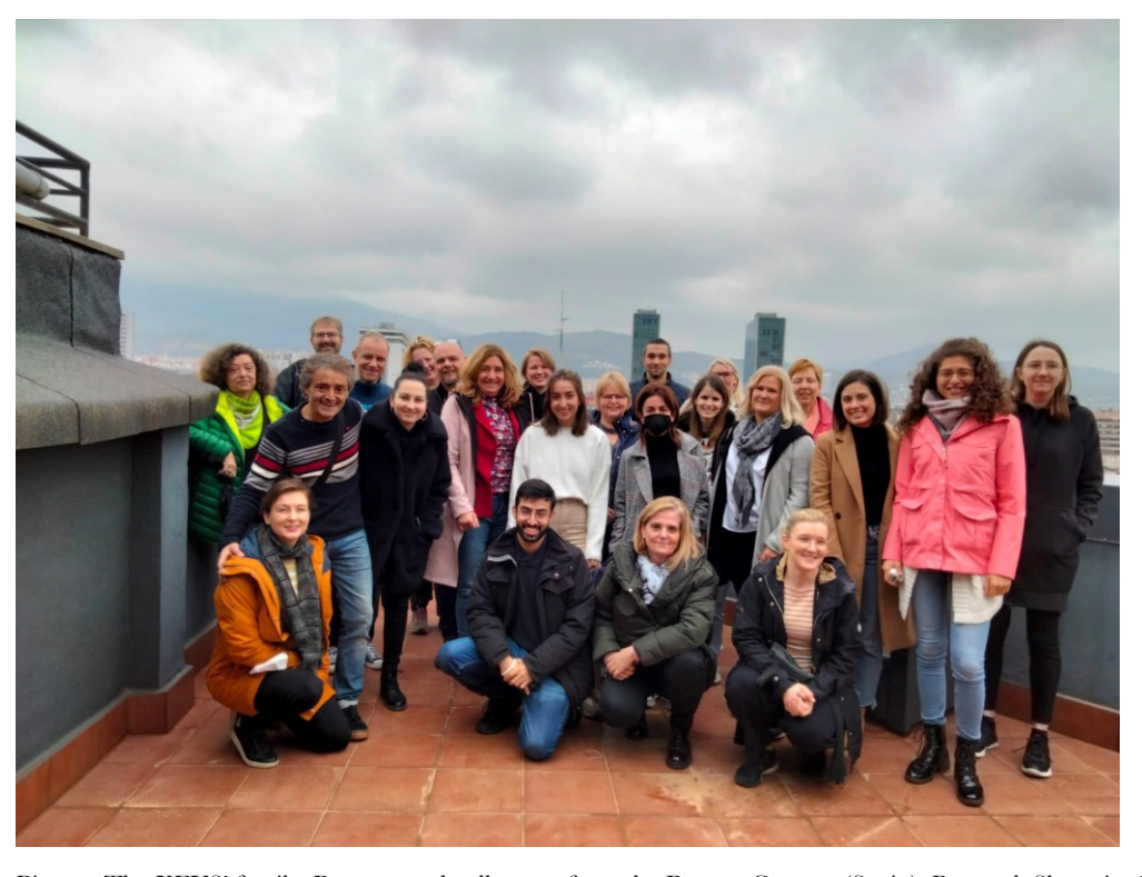
Picture: The KEYS! family. Partners and colleagues from the Basque Country (Spain), Portugal, Slovenia, Greece, Cyprus, the Netherlands. Norway and Finland

We are confident that the KEYS! project will help open doors that will smoothen the transition and integration of migrants from integration/language training to VET and society. KEYS! aims to promote the lifelong learning strategy, highlight European values, and emphasize equal opportunities, diversity, and social inclusion in Europe