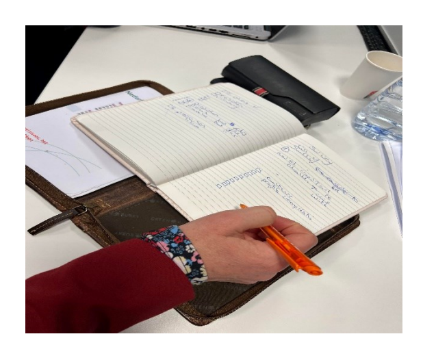
To avoid misunderstandings we clarified the core definitions of the project and agreed on the expectations and challenges we face when educating migrants

The chosen methodology of work was workshops and networking over coffee, lunches and dinners.