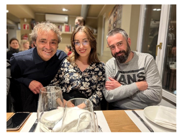
Picture above: Calasanz Santurzi team, one of the hosts of the kickoff meeting

These were the questions that the participants of the KEYS! kickoff tried to answer. We divided the challenges into 3 main categories: 1) Migrant learners, 2) Teachers and 3) relevant Stakeholders